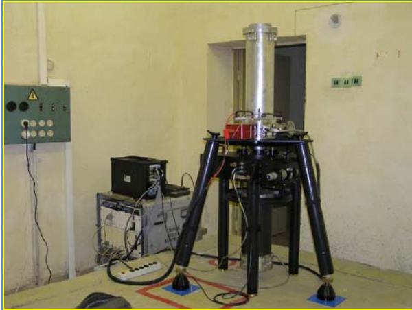
Fig. 2 Chisinau AA absolute gravity station on the main pillar of the Institute of Geophysics and Geology.

gravity data were stored on disk for post processing. A vertical gradient was measured at each absolute and two satellite stations using a combination of three LaCoste & Romberg model G relative gravimeters. The vertical gradient was measured directly over the station by observing at ground level and at a height of +1.00 meter.