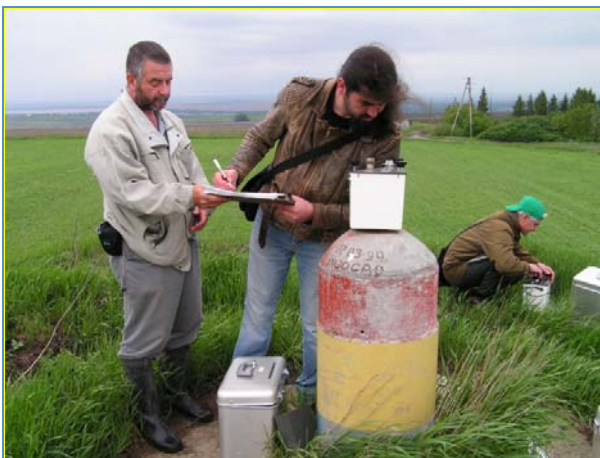
Fig. 3 Palanca E relative gravity station on the EUREF site pillar.

For easier accessibility, an excenter gravity station was established out of doors close to each absolute station. This was accomplished with the same instruments used for determination of the vertical gradient.