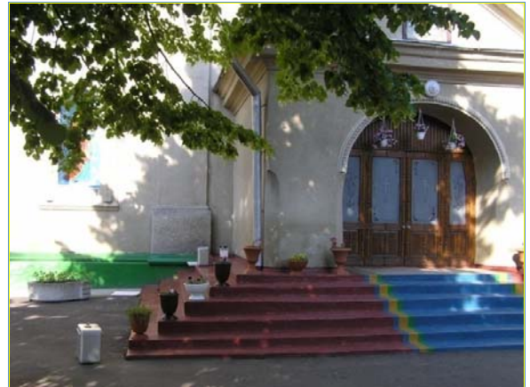
Fig. 4 Balti C relative gravity station on the main entrance stairs of the St. Nicolae Cathedral.

multiple loops from the same or a different control station. A series of polygons were later combined in the data reduction to form a strong country wide first-order gravity network.